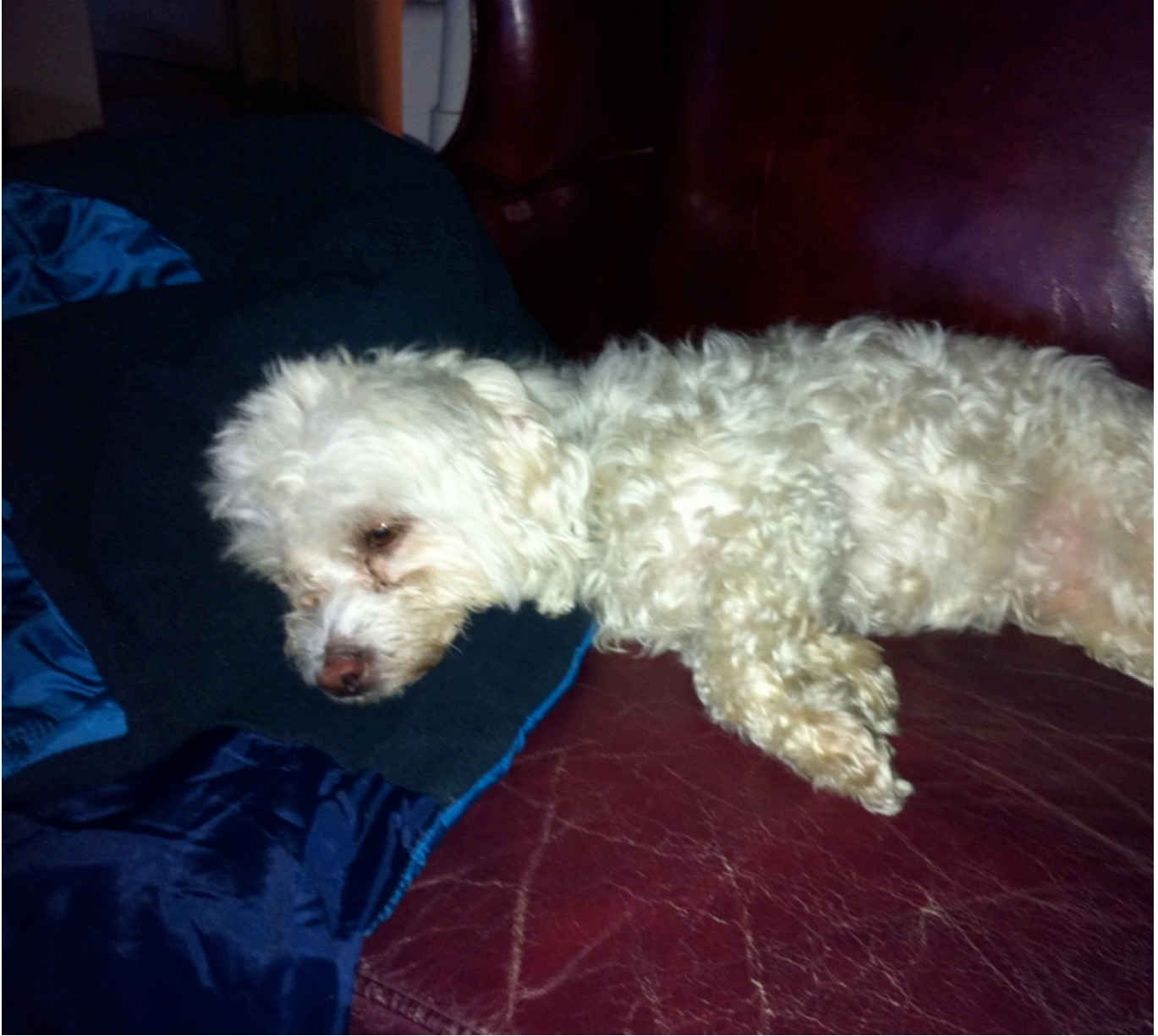
Emma's wounds are serious: