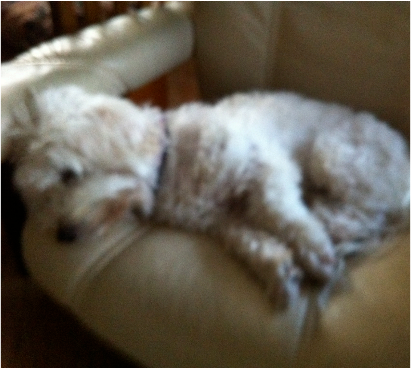
Sparky across the room in the red chair.

Emma's wounds pulled her out of playtime with Emma, and Emma, somehow, knows it. Sparky is still here, and they spend most of their time in their respective chairs, lying down, recuperating emotionally. Emma in the chair in which I usually sit, with her on my lap: