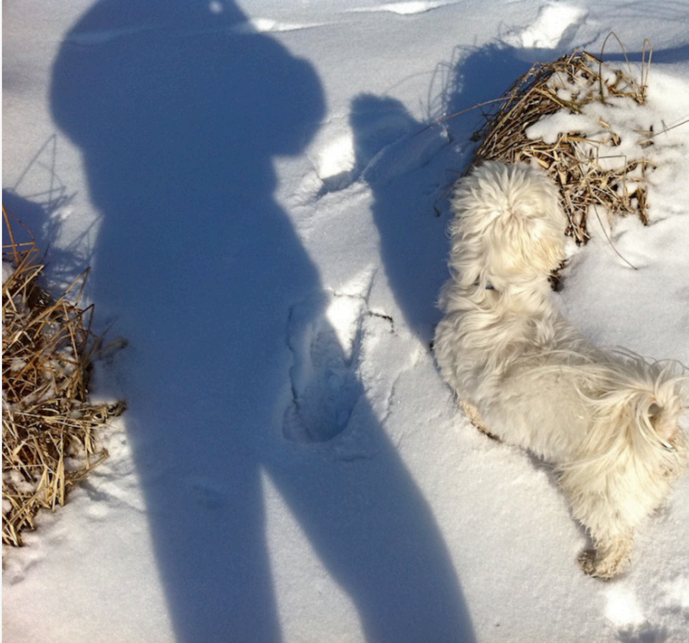
Me and my shadow, winter 2010-2011