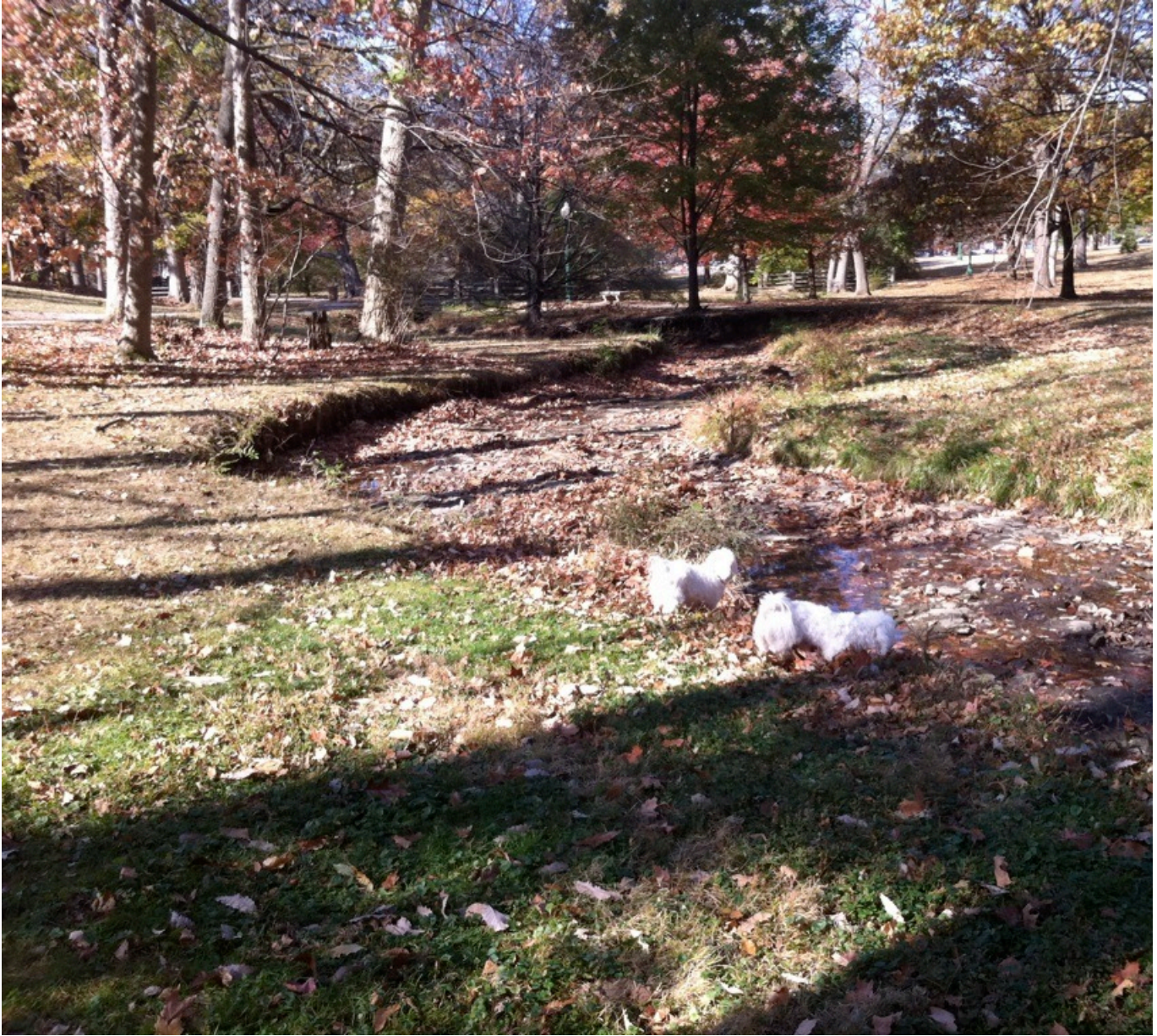
Then back home for another round.